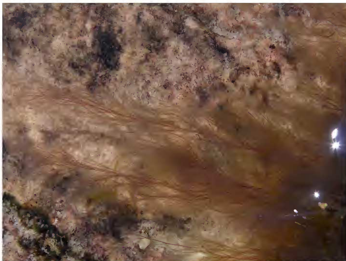
Figure 4: The usually trap-less, filamentous leaves of U. neottiioides in quickly running water, Minas Gerais, Brazil.